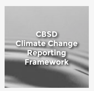
CBSD Climate Change Reporting Framework